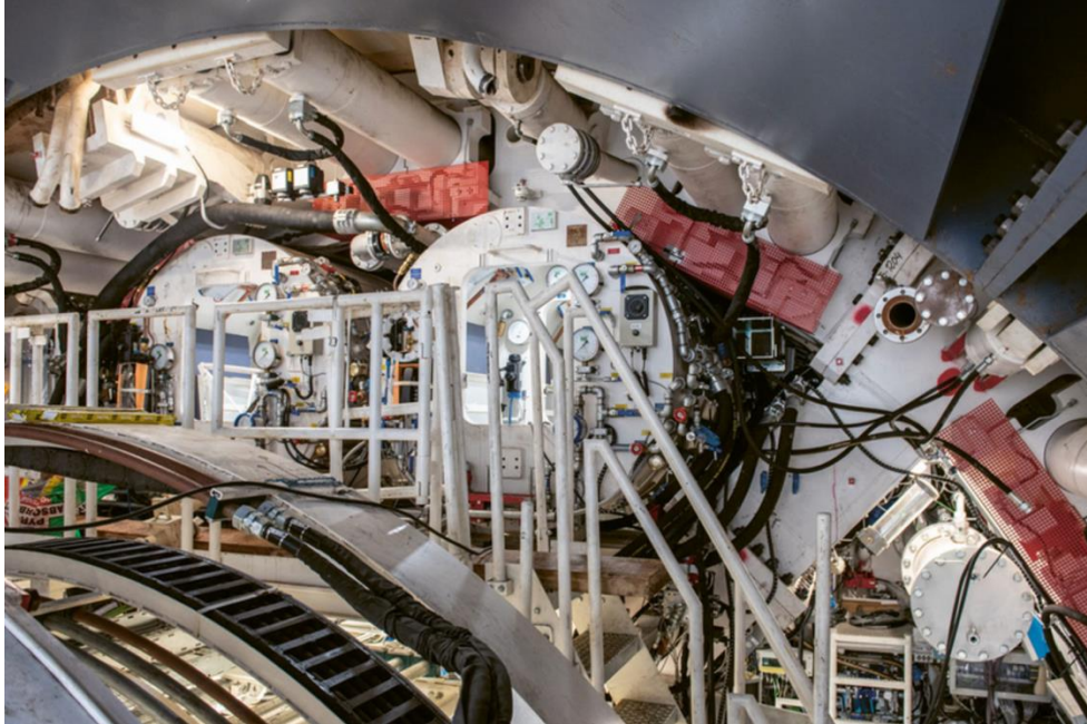
Tunnel boring machine Metro Line B - Lyon